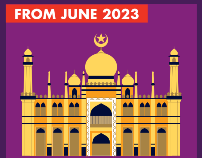
Heritage Tour (Bus Tour)

Zip through Singapore's magnificent cityscape and world-class attractions, including the iconic Merlion Park, the artistic Esplanade and the lush beauty of Gardens by The Bay